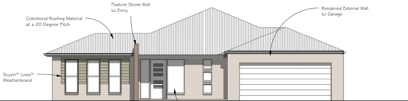
The Laguna Grande - Contemporary Facade

Colorbond Roofing Material at a 20 Degree Pitch