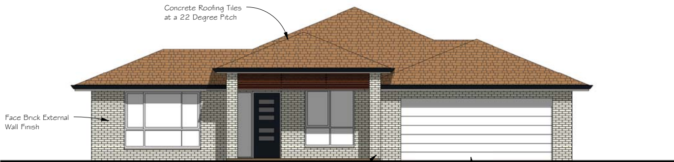
The Laguna Grande - Classic Facade

Concrete Roofing Tiles at a 22 Degree Pitch